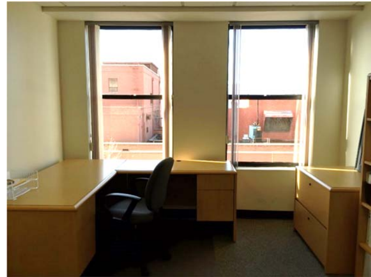
Approximate measure is 11 x 18

Quiet nonprofit has semi-private office space for sublease near Capitol, future arena, and many restaurants. Ideal for 1-2 people. Includes janitorial, furniture, kitchenette, internet, and access to conference rooms. Monthly rent $600. Negotiable term through November 2019. For more information or to view, email megan@consumercal.org or call 916-498-9608.