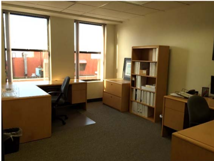
Open, bright space