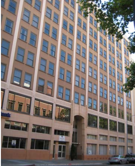
Building exterior – corner of 9 th & K Streets